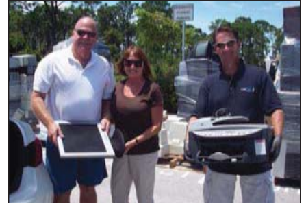
Residents of Indian River County bring their unwanted electronics to a special collection event.